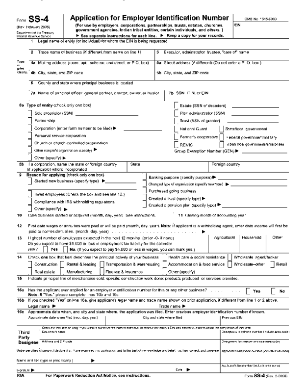
Different editions of IRS form SS-4 (years 2006 and 2007)